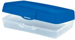
pencil box (any color or style)