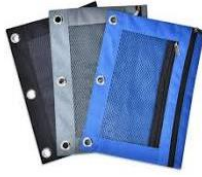
different styles see through window 3 hole pencil pouch