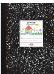
sample of primary composition