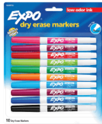
thin expo markers