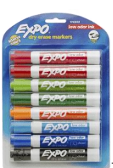
fat expo markers