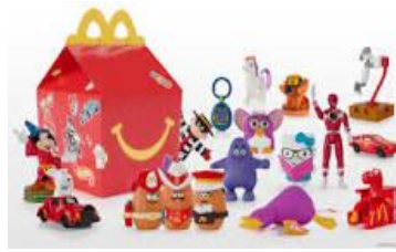
example of small party favors/toys