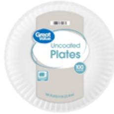
uncoated plain paper plates