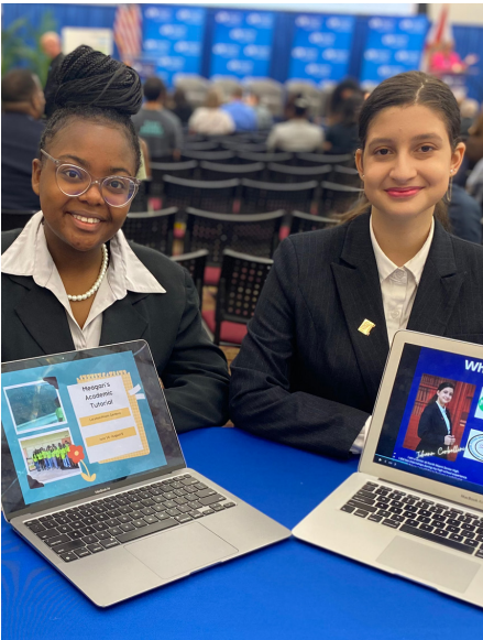
The Summer Youth Internship Program (SYIP) – a partnership between Miami-Dade County Public

Schools (M-DCPS), CareerSource South Florida, The Children’s Trust, Miami-Dade County, the EdFed Educational Federal Credit Union and the Foundation for New Education Initiatives – has officially kicked off for 2022. Entering its 7th consecutive year, SYIP connects rising 10th- through 12th-grade M-DCPS students (ages 15-18) with local businesses for a mutually beneficial workforce experience, July through August 2022.