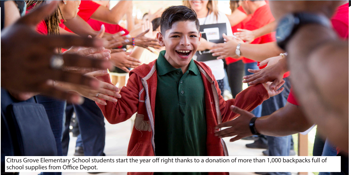
Citrus Grove Elementary School students start the year off right thanks to a donation of more than 1,000 backpacks full of school supplies from Office Depot.