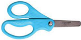
ROUND TIP Fiskars scissors

P.S: See below for images that may help you with some of the items requested.