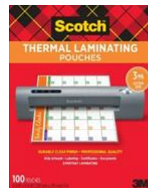
Scotch Thermal laminating Pouches