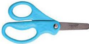
ROUND TIP Fiskars scissors

P.S: See below for images that may help you with some of the items requested.